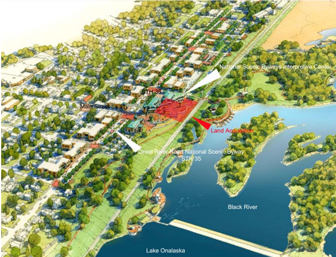
City of Onalaska, Wisconsin